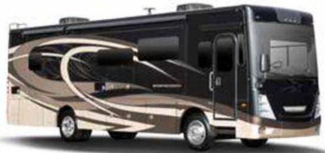
Full Body Paint - Sandstone