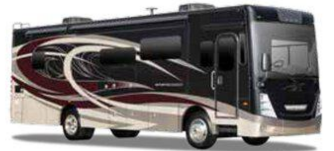
Full Body Paint - Rosewood