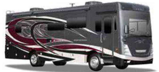
Full Body Paint - Magenta