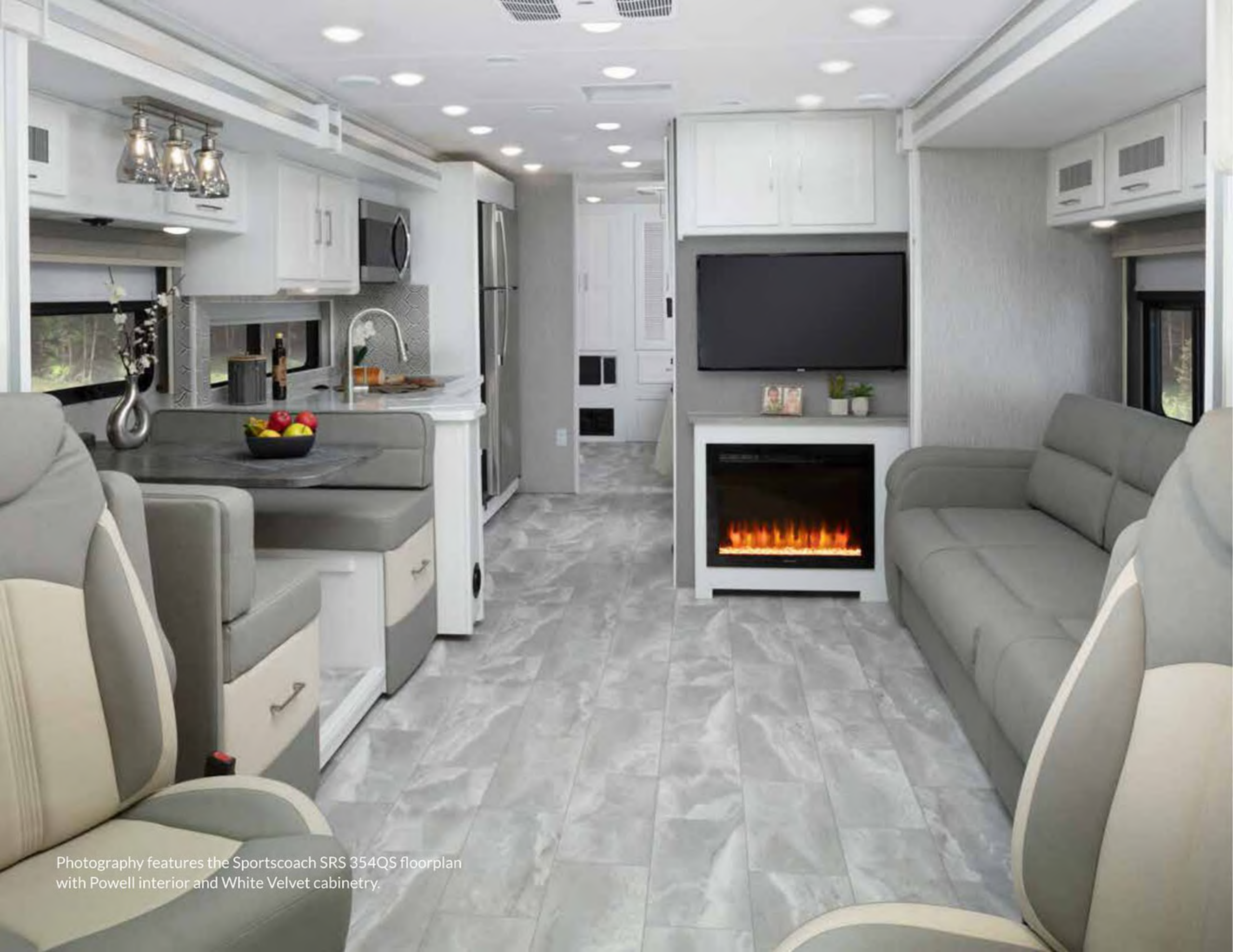
Photography features the Sportscoach SRS 354QS floorplan with Powell interior and White Velvet cabinetry.