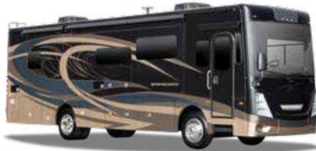
Full Body Paint - Meteor